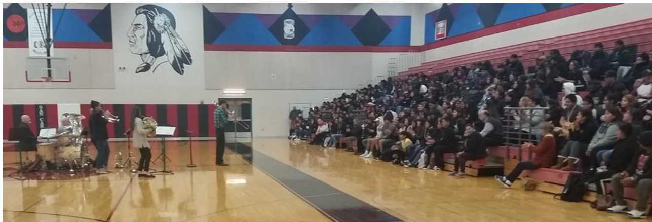
San Carlos High School Gymnasium