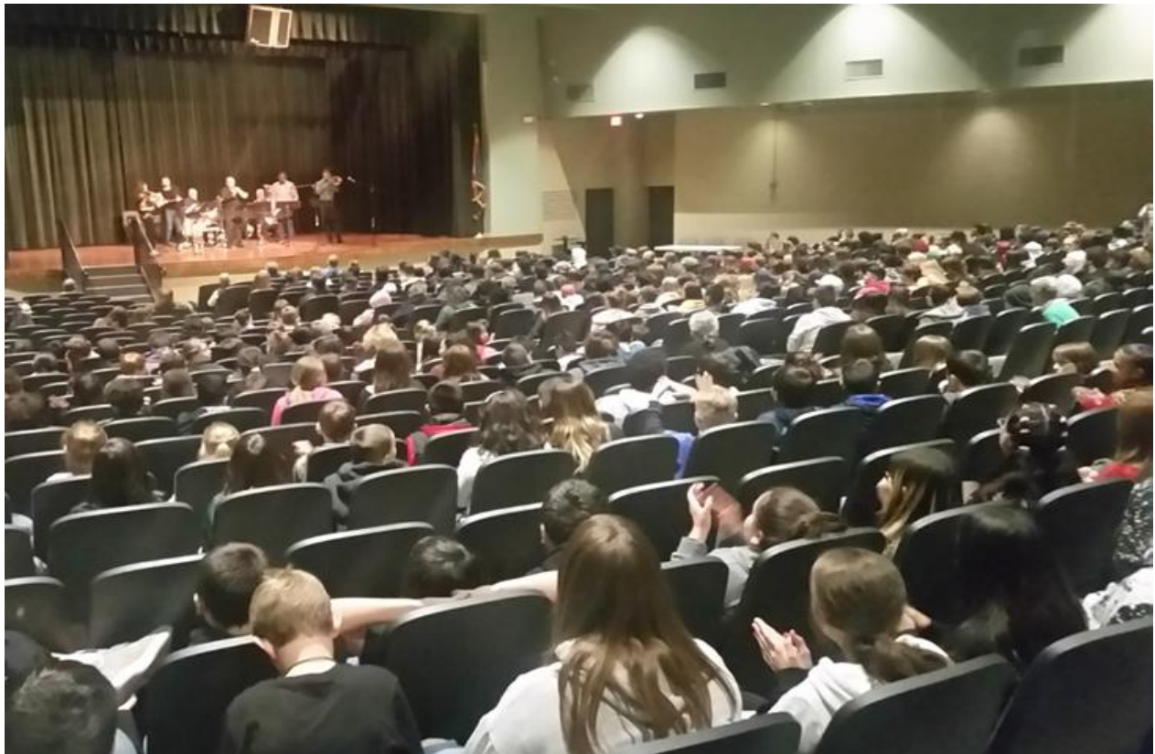
Miami High School Auditorium