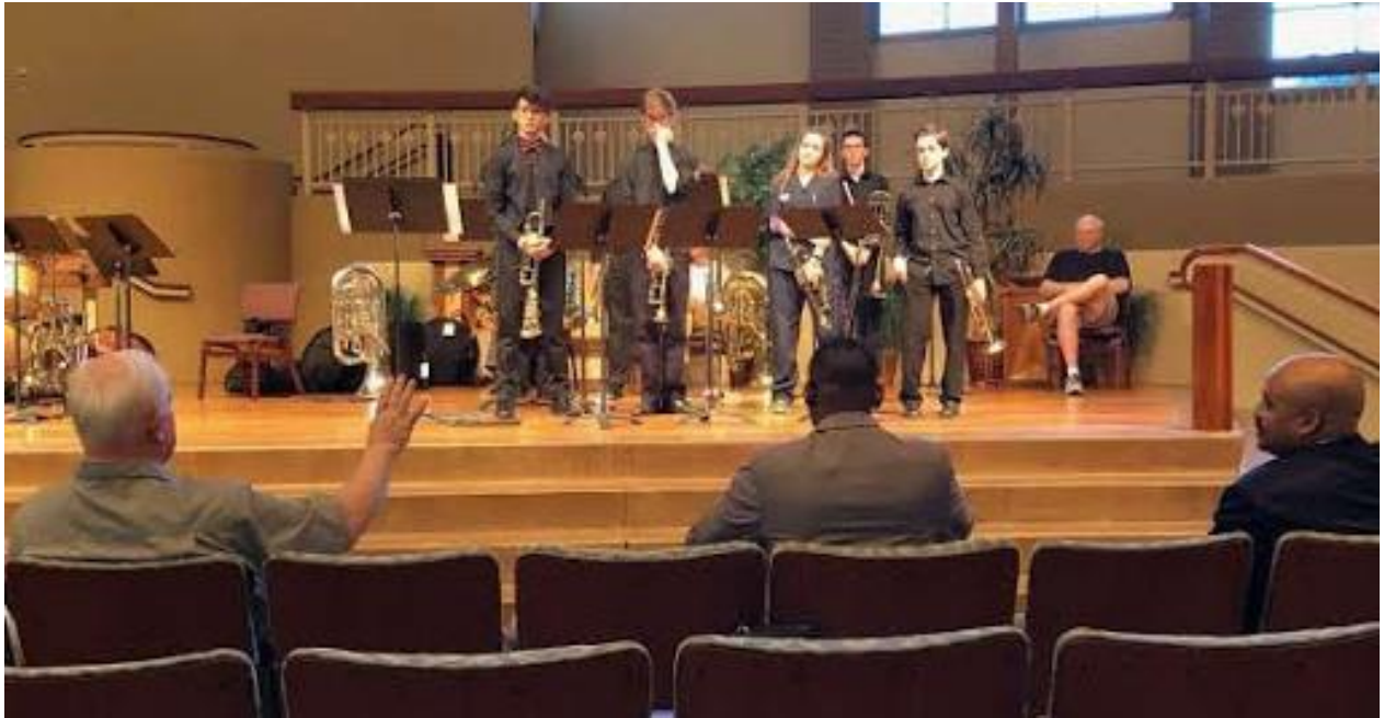
Master Class with Students at the Gold Canyon United Methodist Church