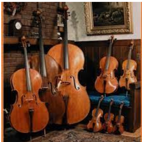
THE HUTCHINS CONSORT Friday, January 12, 2024

Holy Night", and many more of your favorite holiday songs.