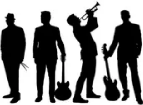
THE FOUR FRESHMEN Sunday, December 3, 2023

Mirari Brass Quintet is one of the country's finest Brass ensembles. Their repertoire is wonderfully eclectic and engaging. The Mirari Brass Quintet brings a spirit of joyful collaboration and innovation to music spanning many centuries and genres. Mirari has performed extensively across the United State, forging connections with audiences through lively and polished performances.