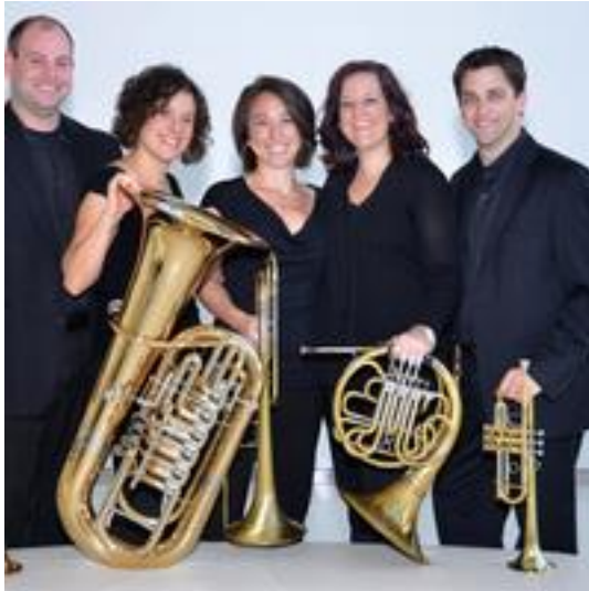
MIRARI BRASS QUINTET Friday, November 17, 2023

Mirari Brass Quintet is one of the country's finest Brass ensembles. Their repertoire is wonderfully eclectic and engaging. The Mirari Brass Quintet brings a spirit of joyful collaboration and innovation to music spanning many centuries and genres. Mirari has performed extensively across the United State, forging connections with audiences through lively and polished performances.