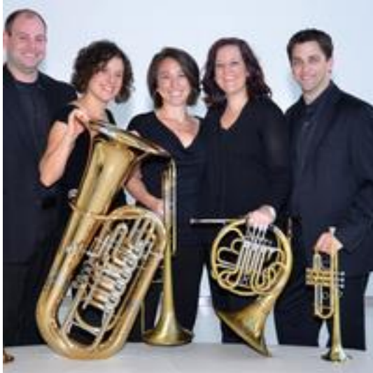
MIRARI BRASS QUINTET Friday, November 17, 2023

Mirari Brass Quintet is one of the country's finest Brass ensembles. Their repertoire is wonderfully eclectic and engaging. The Mirari Brass Quintet brings a spirit of joyful collaboration and innovation to music spanning many centuries and genres. Mirari has performed extensively across the United States, forging connections with audiences through lively and polished performances.