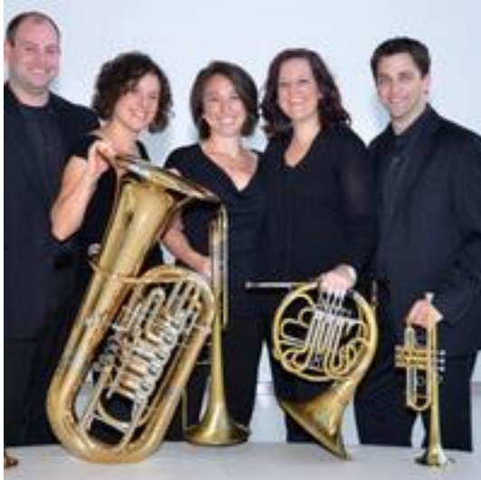
MIRARI BRASS QUINTET Friday, November 17, 2023

Mirari Brass Quintet is one of the country's finest Brass ensembles. Their repertoire is wonderfully eclectic and engaging. The Mirari Brass Quintet brings a spirit of joyful collaboration and innovation to music spanning many centuries and genres. Mirari has performed extensively across the United States, forging connections with audiences through lively and polished performances.