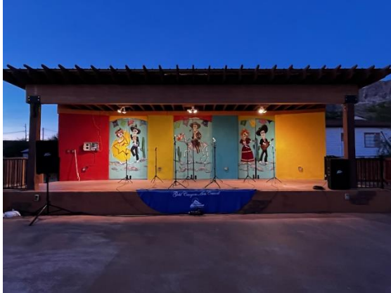
Stage w/ Mariachi Pasion