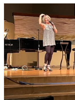
and on stage